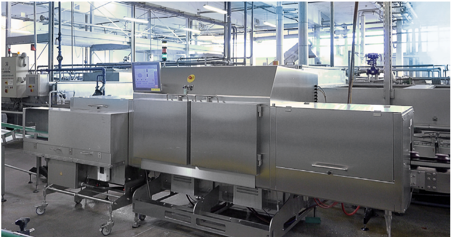
Dual View X-ray scanner for optimal inspection of standing products