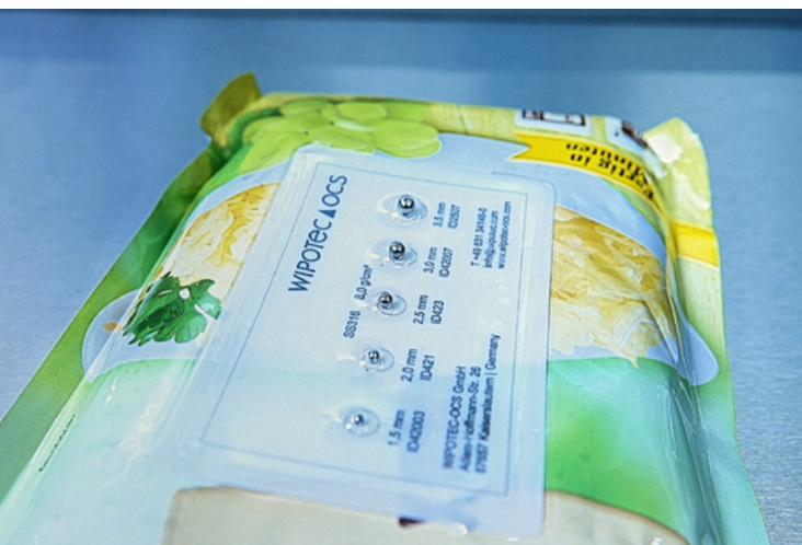
Foreign body card for testing the X-ray system