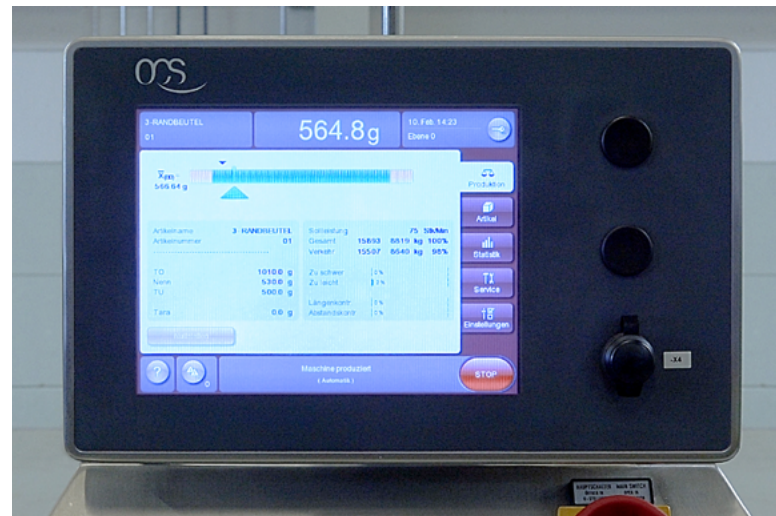
Identical user interface on all Wipotec systems

The checkweigher is operated using the integrated display. All relevant data and additional statistics can be viewed at a glance in real time. The display surface is identical for all Wipotec systems, making operation of the systems fairly intuitive.