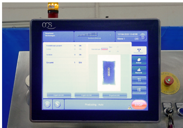
Easy to see: All foreign bodies were detected