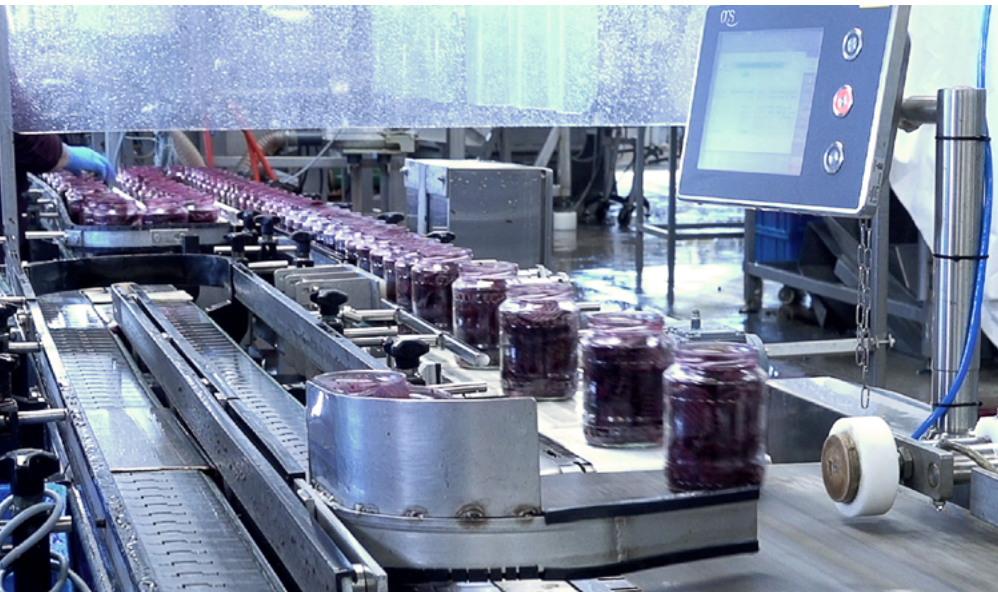
Separation of beet jars for checkweighing