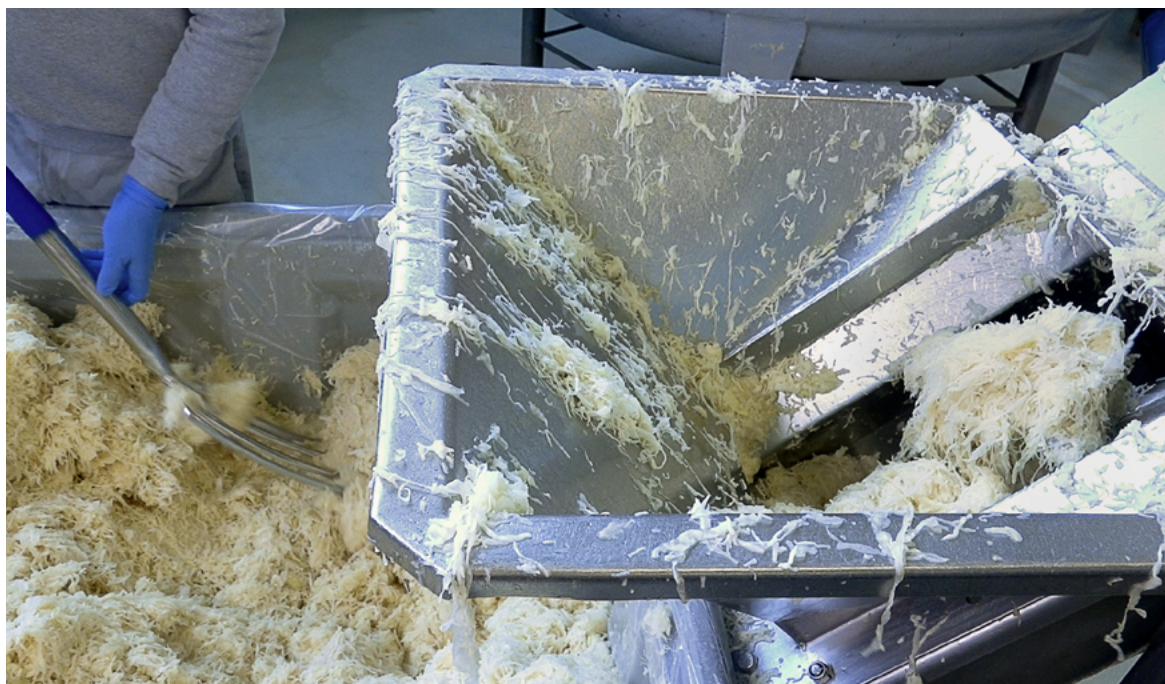
Feeding sauerkraut into the filling process